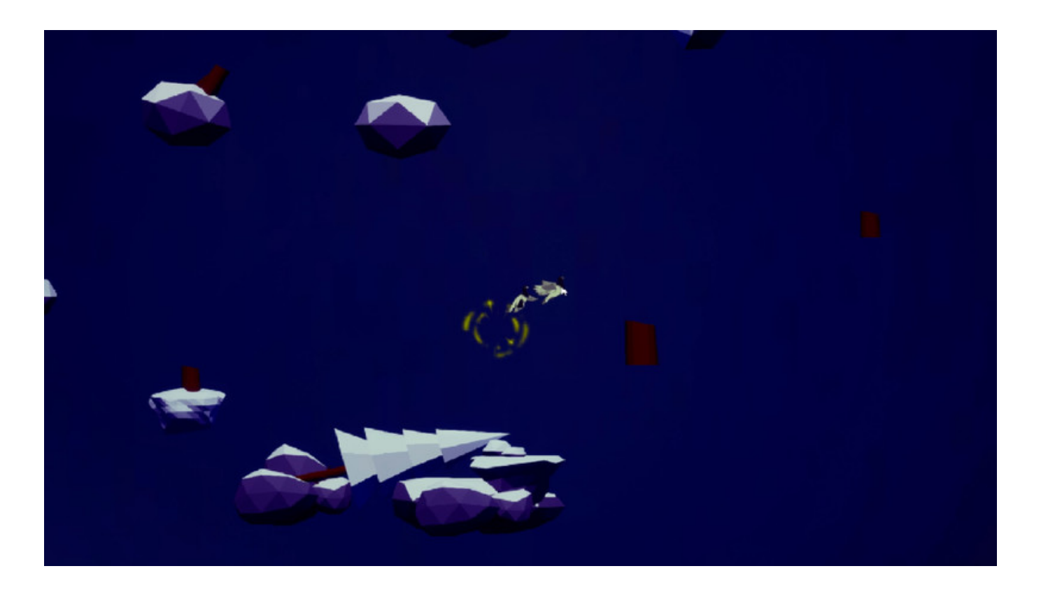
Flapping Over It Download Setup

Download ->>> <a href="http://bit.ly/2SISgTY">http://bit.ly/2SISgTY</a>